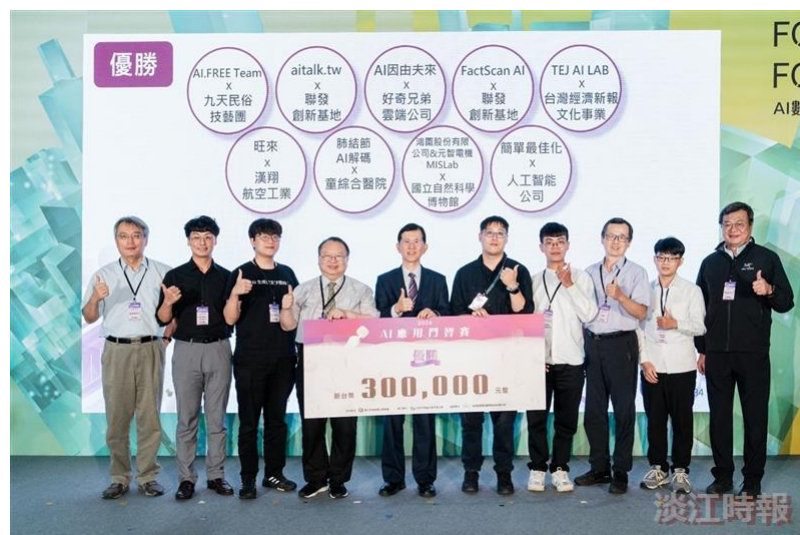
The Department of Computer Science and Information Engineering won the championship in the AI Application Challenge.

The Department of Mechanical and Electro-Mechanical Engineering secured approximately NT$40 million in funding through the Ministry of Education's Machine Tool Teaching Equipment Renewal Program.