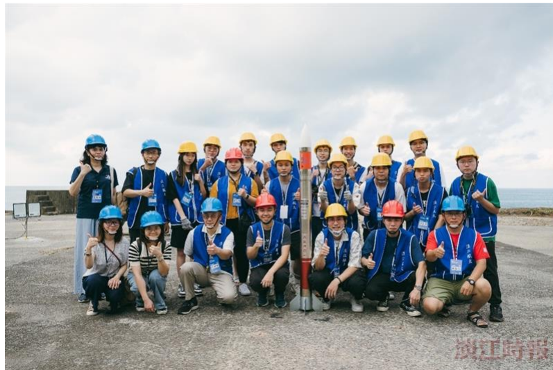
Faculty and students of the Space Technology Laboratory pose with the "TKU-I" research rocket at the Launch Site in Xuhai.