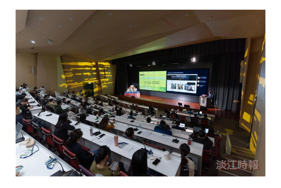
The 8th International Conference on Smart Campus and Exhibition (iCSC&E) was held all day on November 21 at the Hsu Shou-Chlien International Conference Center on the Tamsui campus.