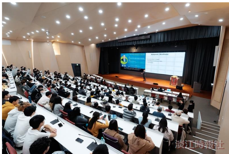
During the speech