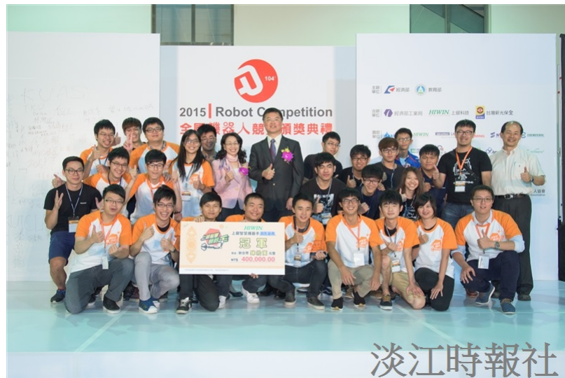
The Department of Electrical and Computer Engineering and the Department of Mechanical and Electro-Mechanical Engineering performed beautifully in the 2015 Robot Competition.