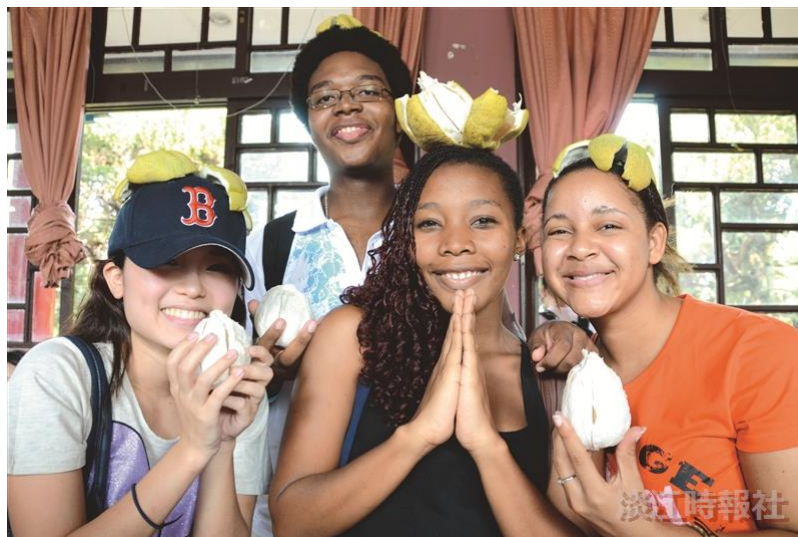
TKU foreign students experience the Taiwanese custom of wearing “grapefruit hats” during Mid-Autumn Festival.