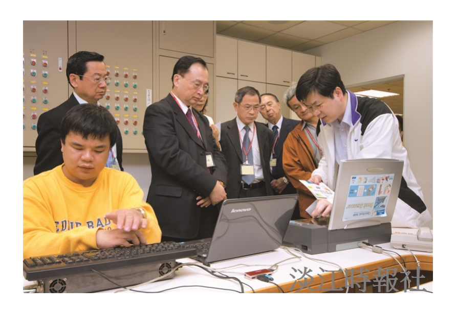
The 2011 TKU Institutional Evaluation