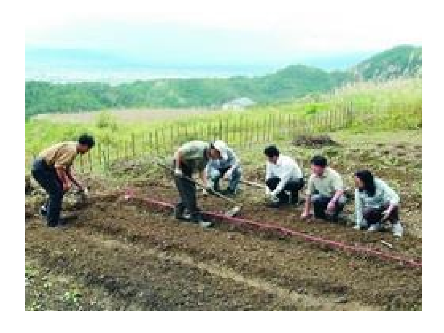
Planting vegetables and fruits in the Lanyang Campus is a great recreation for teachers and students of the TKU.